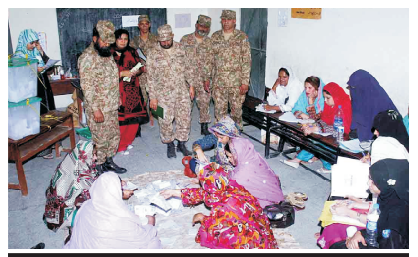
Polling taking place for Cantonment Board election on April 25, 2015 10

After a long gap of 17 years, Cantonment Board elections were held in 42 Cantonment Boards across the country on April 25, 2015. All the stakeholders involved in the Cantonment Board election should be congratulated for carrying out the exercise before the Provincial Governments of Punjab, Sindh and Khyber Pakhtunkhwa.