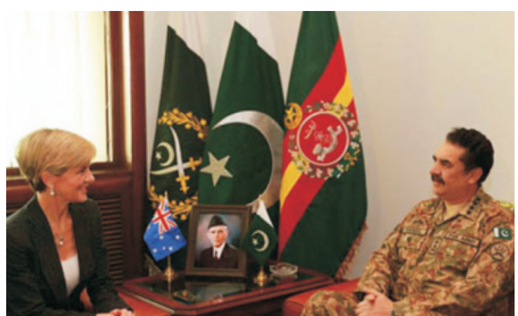
The Australian Foreign Minister, Ms. Julie Bishop, during her visit to the GHQ on May 07, 2015

According to a pattern already highlighted by PILDAT in its Monitor on Civil-Military Relations for Pakistan, April 2015, the Australian Foreign