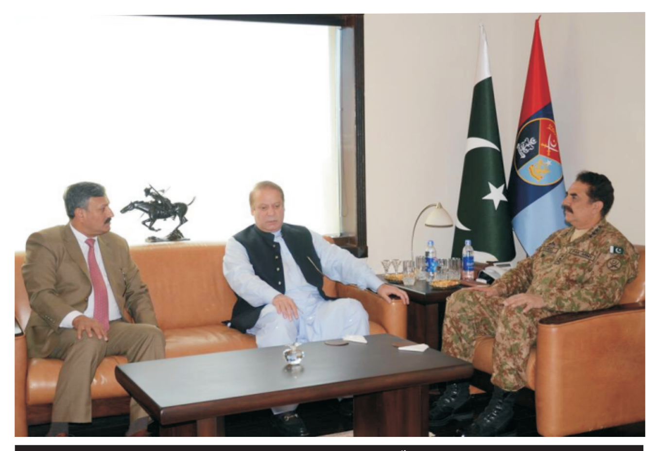
The Prime Minister and COAS in a meeting with the DG ISI at the ISI Headquarter. <sup>15</sup> Does the seating arrangement reflect the proper protocol?

During the month of May 2015, the Prime Minister and the COAS interacted face-to-face, for a total of six times, with the details as follows: