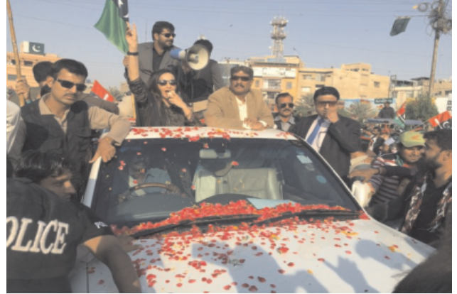
PPP Vice President, Ms. Sherry Rehman leading a PPP rally in Karachi on November 29, 2015