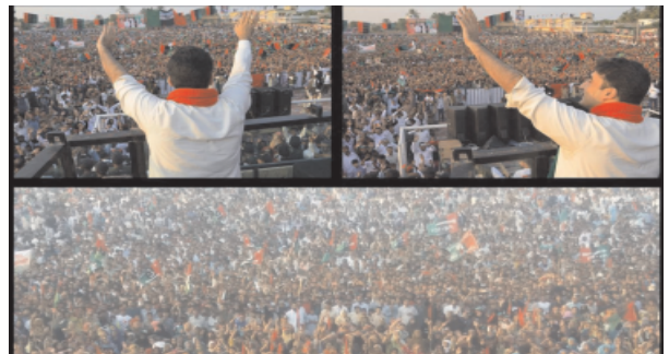
PPP Chairman Bilawal Bhutto Zardari addressing PPP rally on PPP Foundation Day in Karachi, November 30, 2015