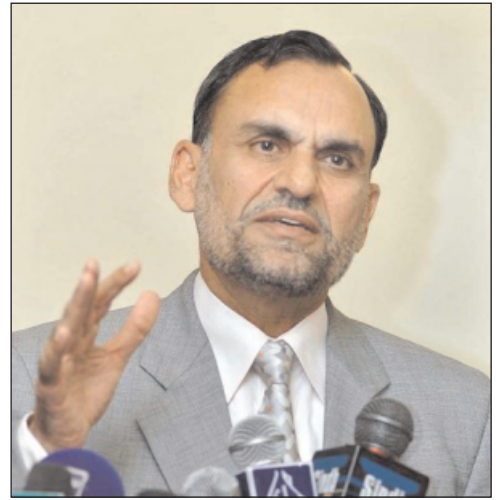
Senator Azam Khan Swati