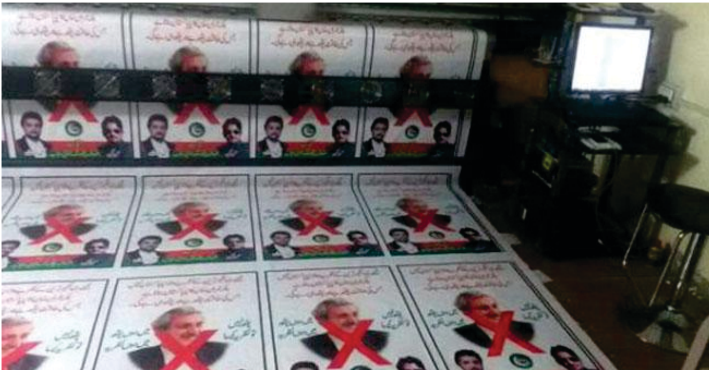
Anti-Tareen posters reportedly printed by the dissolved youth wing of PTI; Source: The News

It goes without saying that the decision should have been taken after consulting the relevant stakeholders in the party, such as, at least the heads of all the party wings that were dissolved. It is reported in the media that Ms. Munaza Hassan, MNA and Head of the PTI Women Wing, was informed of the decision through a notification without any prior consultation or communication.