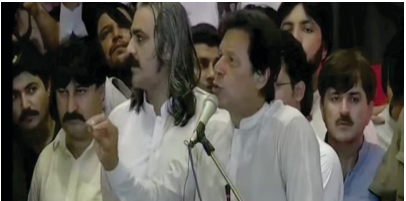
PTI Chairman addressing party workers convention in Islamabad on September 18, 2016

He also talked about fissures emerging within the party as a result of the dissolution of important wings of the party on September 10, 2016 and called for unity in the party.